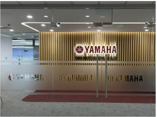
(Entrance of the office)